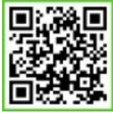
Bentonville Pride (Students Only)

When traveling we use Band App to keep students and parents in the know.